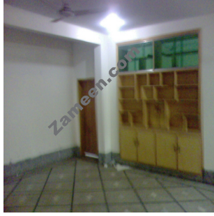
TV LOUNGE VIEW