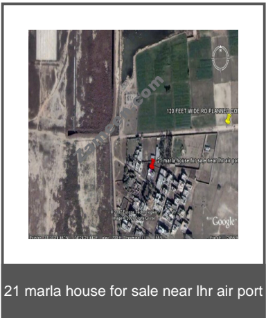
21 marla house for sale near Ihr air port